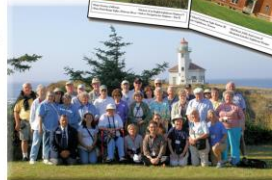
Society Members Tour Cape Arago Lighthouse, Oregon