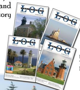
USLHS The Keeper's Log Magazine

To Join the U.S. Lighthouse Society and begin your subscription to The Keeper's Log Magazine... Call - 415-362-7255 or visit our website at www.uslhs.org